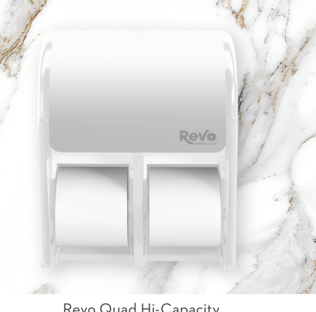
Revo Quad Hi-Capacity Small Core Tissue Dispenser, White

Revo Quad Hi-Capacity Small Core Tissue Dispenser, Black