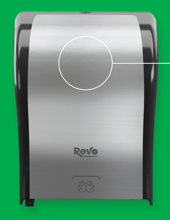
Standard Dispenser Colors