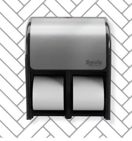
Revo Quad Hi-Capacity Small Core Tissue Dispenser, Stainless