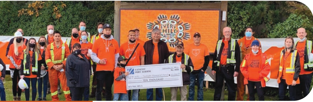
Paper Excellence donated $10,000 to the ?uu?atumin yaqck<sup>w</sup>iimitqin "Doing it for our ancestors" project that works to heal and bring answers to those affected by the Alberni Indian Residential School (AIRS) and is led by the Tseshaht First Nation.

Paper Excellence understands the importance of being good neighbours and greatly values its relationships with Indigenous communities.